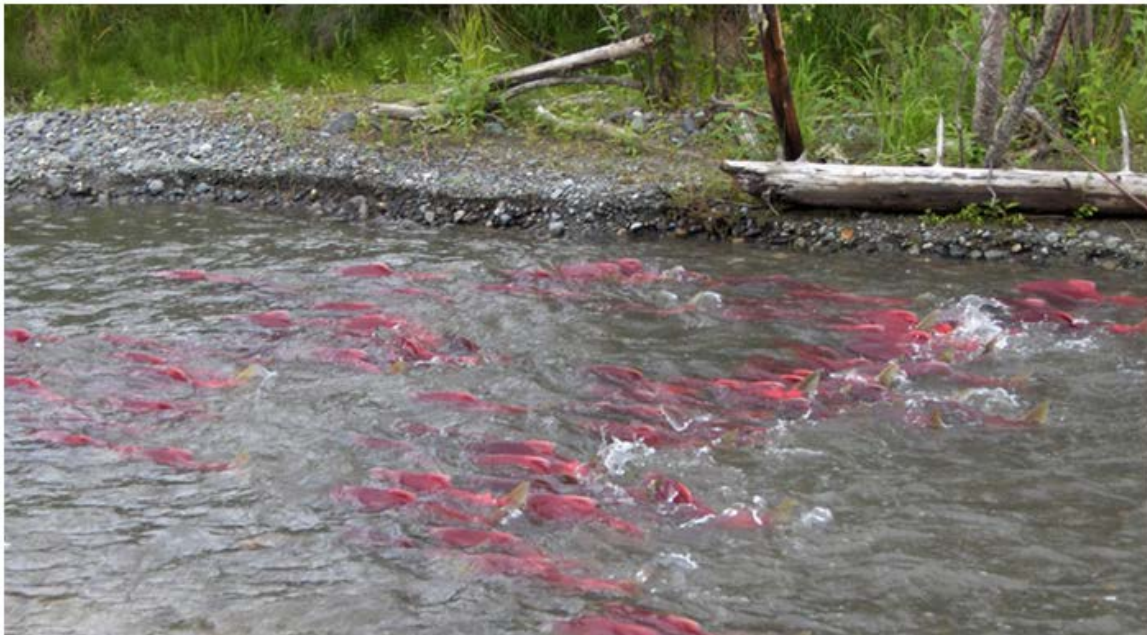
Susitna sockeye salmon display their spawning colors as they migrate up a clear-water tributary.