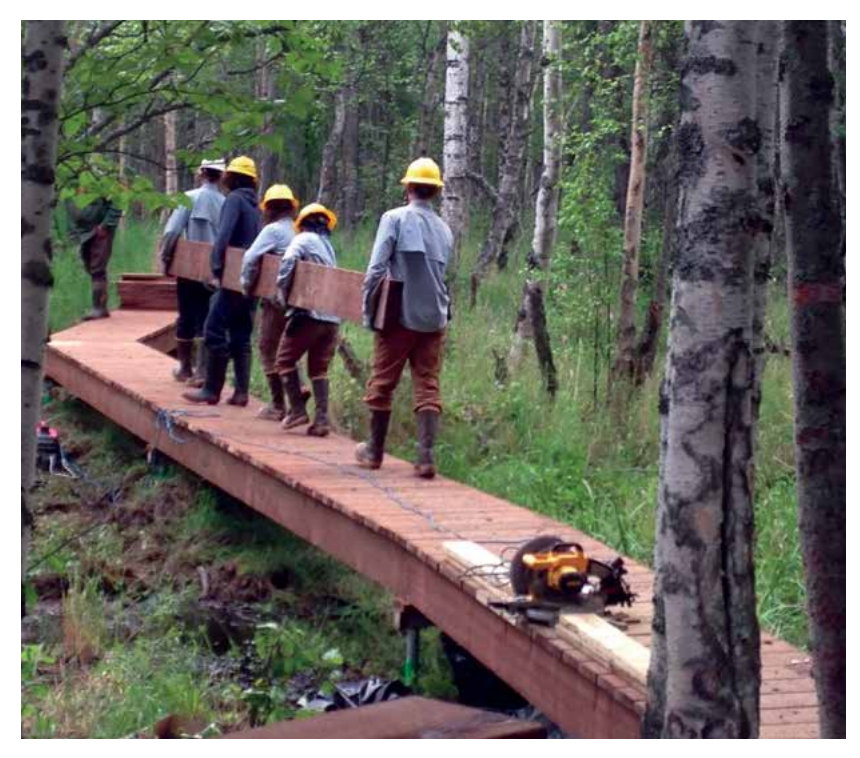
Great Land Trust partnered with the Student Conservation Association to build a light penetrating wetland boardwalk that provides an easy way for people to experience the Palmer Hay Flats Game Refuge.