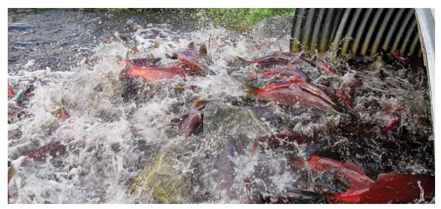
Sockeye salmon struggling to move upstream through a road-stream crossing to spawning grounds.

The quality of salmon spawning, rearing, and overwintering habitat in the Mat-Su is closely linked to the level and location of human activity. Areas that overlap with more developed locations like the Palmer-Wasilla area are more degraded. Impacts are typically related to removal or alteration of native shoreline vegetation, degraded water quality, fish passage impediments and water flow changes.