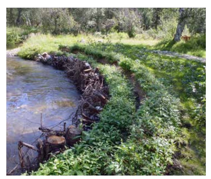
Restoring streambanks on Wasilla Creek. These vegetated shoreline areas provide cover for juvenile fish; cooler temperatures; have slower moving currents where weaker swimming fish can rest; and have over-hanging plants that fall into the water, creating food sources for aquatic insects that juvenile salmon eat.